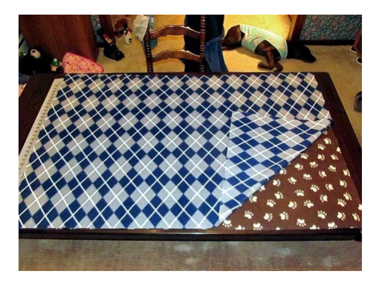
Step Three: Mark off a four-inch square in each corner.

Cut off the selvages on each piece of fleece. There will be 2 selvages on each piece. One selvage is usually white with printing on it and the other usually looks like the rest of the fleece but has tiny holes in it – you really want to remove them for a nice finish. (Save the selvages! Knot them together in various ways and boom: instant dog toy!) Then lay your fleece pieces on top of each other – they don't have to match up EXACTLY. In this case, close is good enough. If your fleece has a "right" and "wrong" side, you want wrong sides together.